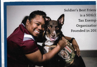
Soldier's Best Friend is a 501(c)(3) Tax Exempt Organization Founded in 2011